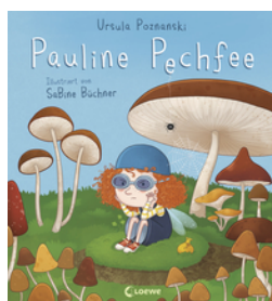
Pauline the Flop-Fairy