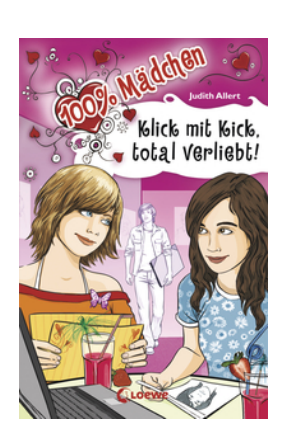
100% Girls - A Click Away From True Love!