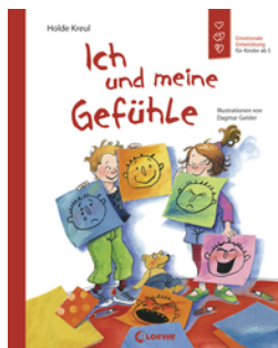
My Feelings and Me