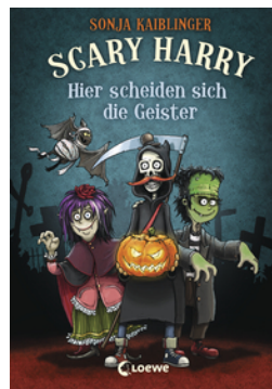
Scary Harry – Strife Among the Spooks (Vol. 5)