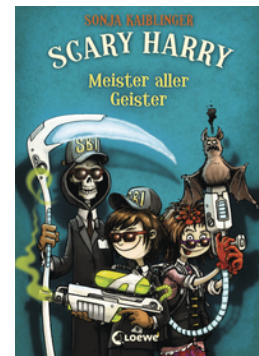
Scary Harry – Master of All Ghosts (Vol. 3)