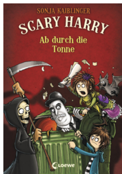
Scary Harry – Down the Can (Vol. 4)