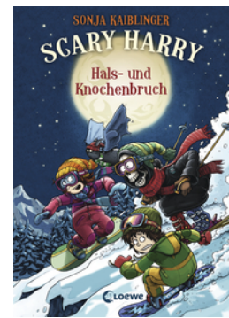
Scary Harry – Break a Legbone (Vol. 6)