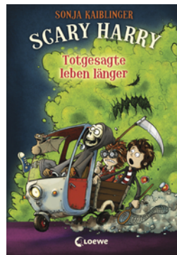
Scary Harry – The Reported Dead Live Longer (Vol. 2)