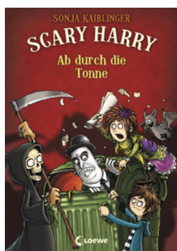
Scary Harry – Down the Can (Vol. 4)