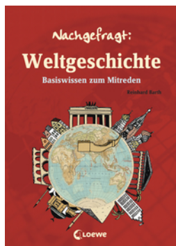
Guide to World History