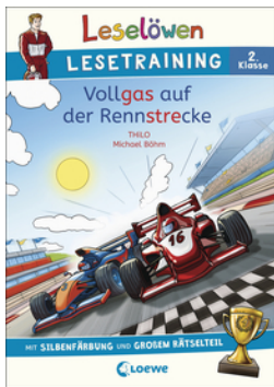
Leselöwen Reading Training Year 2 - Highspeed on the Race Track