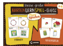
My Big Box of Clever Games - Shapes & Opposites

... and 13 more titles by these authors.