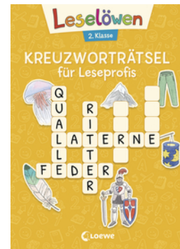
Reading Lions Crosswords for Beginning Readers - Year 2