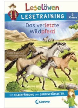
Leselöwen Reading Training Year 2 - The Injured Wild Horse