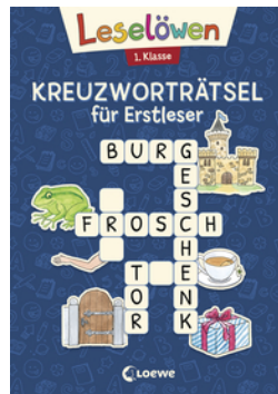
Reading Lions Crosswords for Beginning Readers - Year 1