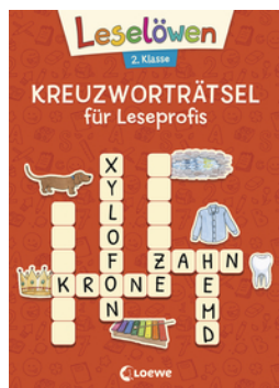
Reading Lions Crosswords for Beginning Readers - Year 2 (Red)