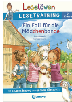
Leselöwen Reading Trainign Year 2 - A Case for the Girl's Gang