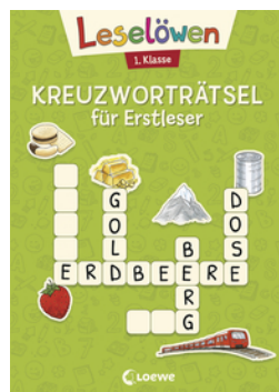
Reading Lions Crosswords for Beginning Readers - Year 1 (Light Green)