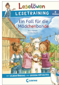
Leselöwen Reading Trainign Year 2 - A Case for the Girl's Gang