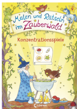
Drawing and Puzzle-solving in the Enchanted Forest - Concentration Games