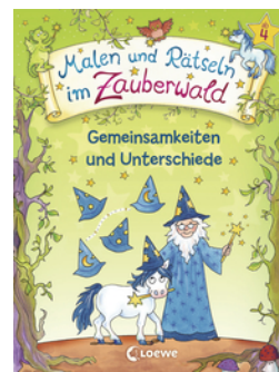
Drawing and Puzzle-solving in the Enchanted Forest - Similarities and Differences