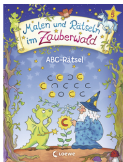
Drawing and Puzzle-solving in the Enchanted Forest - ABC-Quiz