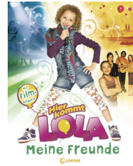
Here Comes Lola! My Best Friends