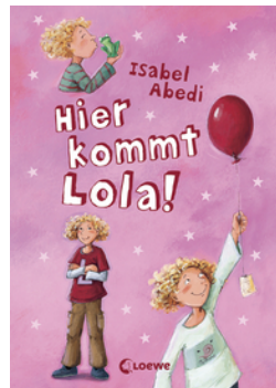
Here Comes Lola! (Vol. 1)