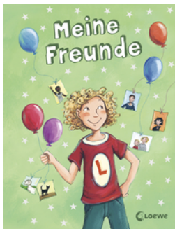
My Best Friends