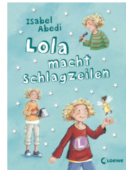
Lola Makes Headline News (Vol. 2)