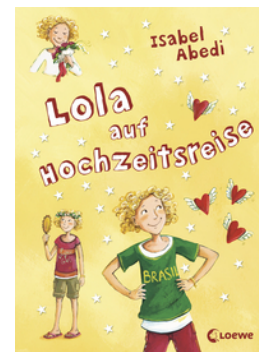
Lola on Honeymoon (Vol. 6)