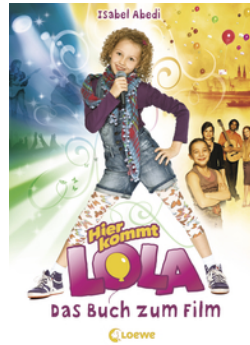
Here Comes Lola! (Movie Book)