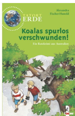
Global Mysteries – The Mystery of the Disappearing Koalas