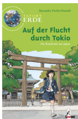
Global Mysteries – Chased through Tokyo