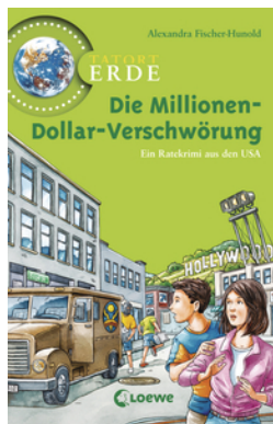
Global Mysteries – The Million Dollar Conspiracy