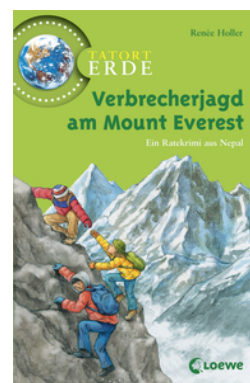
Global Mysteries – Hunting Criminals At the Foot of Mount Everest