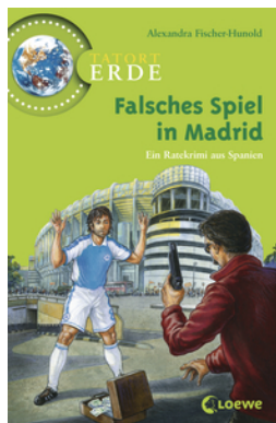
Global Mysteries – Foul Game in Madrid