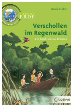
Global Mysteries – A Disappearance in the Rain Forest