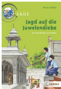
Global Mysteries – The Hunt for the Jewel Thieves