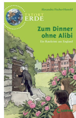
Global Mysteries – Dinner without an Alibi