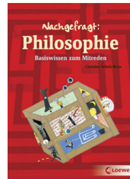
Guide to Philosophy