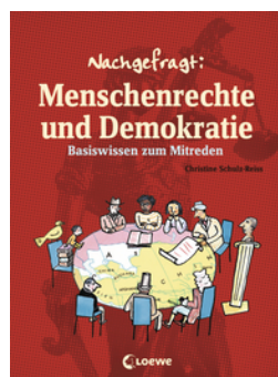
Guide to Human Rights and Democracy