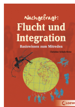
Guide to Refugee Migration and Integration