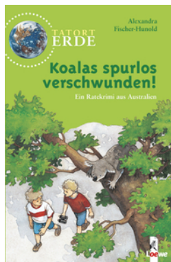
Global Mysteries – The Mystery of the Disappearing Koalas