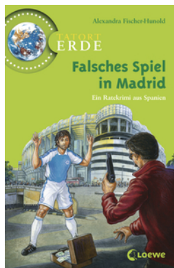
Global Mysteries – Foul Game in Madrid