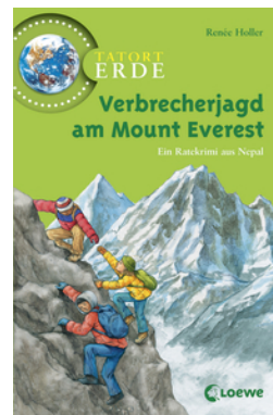
Global Mysteries – Hunting Criminals At the Foot of Mount Everest