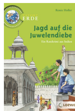
Global Mysteries – The Hunt for the Jewel Thieves