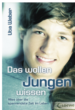
All Boys Want to Know – Facts about the Most Exciting Time of Life