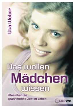
All Girls Want to Know – Facts about the Most Exciting Time of Life