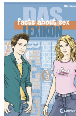
Facts About Sex - An Encyclopaedia