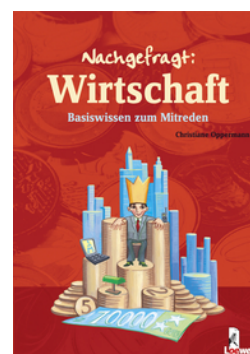
Guide to Economics