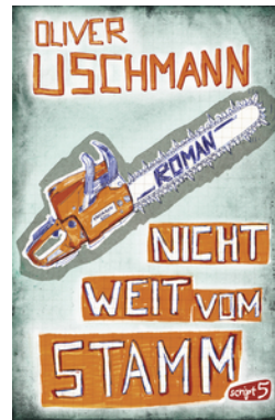
Chip off the Old Block