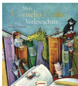
My Cornelia Funke-Reading Treasure