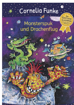
First Reading-Classic - Monster's Spook and Dragon Flight