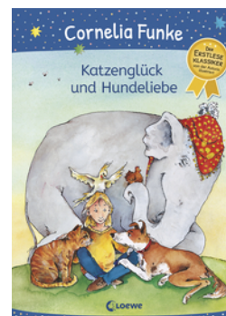
First Reading-Classic - Cat Luck and Dog Love