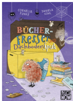
Book Crunchers and Attic Hauntings