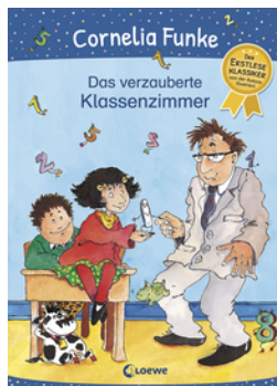
First Reading-Classic - The Enchanted Classroom