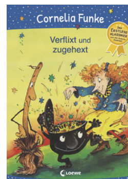
First Reading-Classic - Blessed and Bewitched