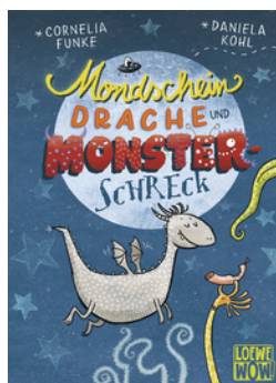
Moonshine Dragon and Monster Shock