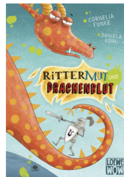
Knighthood and Dragon's Blood