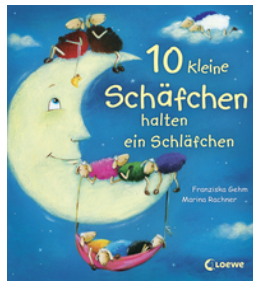
10 Little Lambs Take a Nap