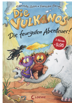
The Vulkanos – Their Most Explosive Adventures