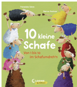
10 Little Sheep