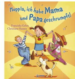
Hey, I've Shrunk Mum and Dad!