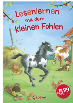
Learning to Read with the Little Foal