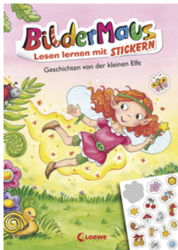
Tales of the Little Elf