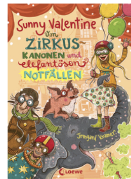
Sunny Valentine – Circus Cannons and Elephantine Emergencies (Vol. 4)