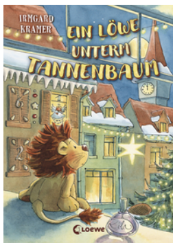
A Lion under the Christmas Tree