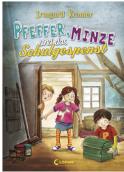
Pepper, Mint and the School Ghost (Vol. 2)