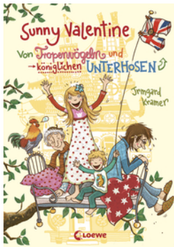
Sunny Valentine – Tropical Birds and Royal Underpants (Vol. 1)