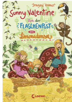
Sunny Valentine – Message in a Bottle in the Lemonade Lake (Vol. 3)