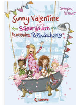
Sunny Valentine – Foam Baths and Dancing Roller-Skates (Vol. 2)