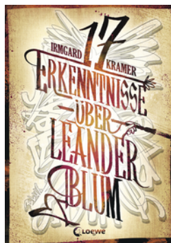
17 Things I've Learned about Leander Blum